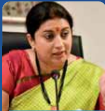
Smt. Smriti Z Irani Hon'ble Union Minister Govt. of India