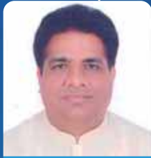
Sri Bhupendra Yadav Hon'ble M.P. (Rajya Sabha)